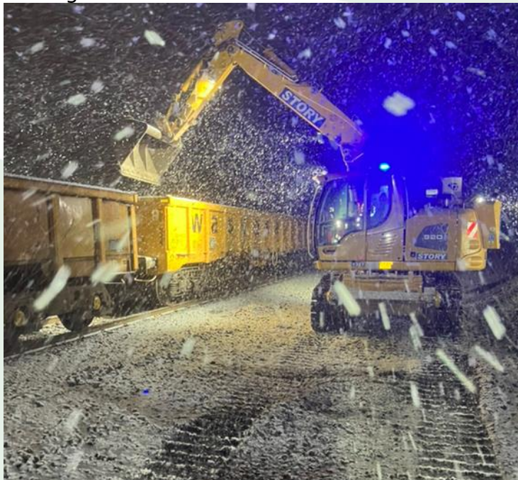
Night works underway between Holywell and Seghill during the recent snow

Welcome to the March 2023 edition of the Northumberland Line newsletter. The aim of this newsletter is to give an overview of upcoming site work, as well as letting you know about key project milestones.