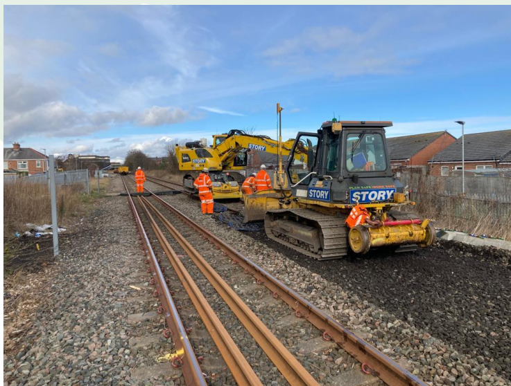
Excavation of the track at Hospital Level Crossing

A further phase of work is scheduled for Thursday 20 July to Monday 24 July 2023 . This phase will see the renewal of a further 200m of track between Hospital Level Crossing and the new station.