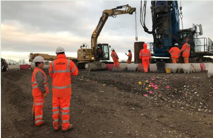
Piling works at Newsham Station site

Piling works are currently underway as part of the station and platform construction. This activity is expected to continue into May 2023.